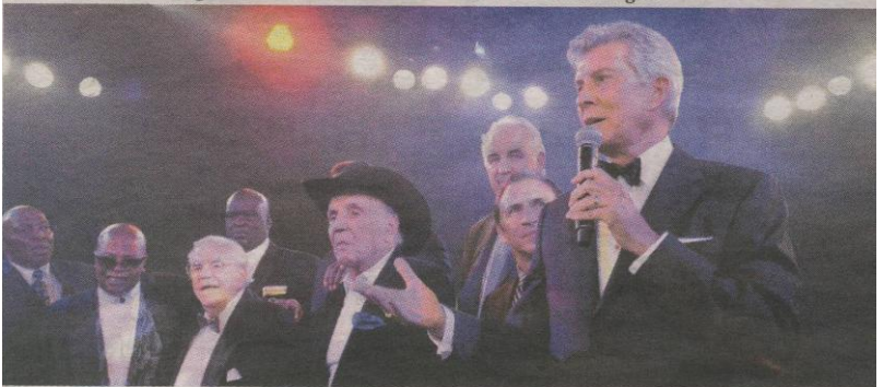
Boxing announcer, Michael Buffer (RT) with the Legends of Boxing