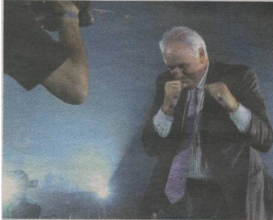
Former Heavyweight Boxer, Gerry Cooney at Fight Night 2011