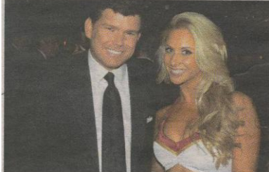
Fox News anchor, Bret Baier and a Washington Redskins Cheerleader