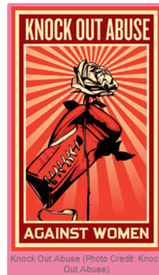
Knock Out Abuse

I attended the reception and it was lovely. After checking in as media, I ran into the beautiful actress, former model, author, women health activist and Knock Out Abuse Honoree, Carre' Otis. She is the author of Beauty Disrupted . The book talks about how underage women are abused in the modeling industry. She is working to prevent young models from being exploited. She shared with me how young women are treated like clothes hangers and are only being valued for bodies and not who they are as people. She wants to change how women are treated in the modeling industry and overall. We are more than just our bodies. While she hasn't testified to Congress yet, organizations she works with are lobbying Congress. Carre' is simply a gorgeous person inside and out and it was a huge pleasure talking with someone in her stature that is so passionate, educated about the issues and down to earth nice!